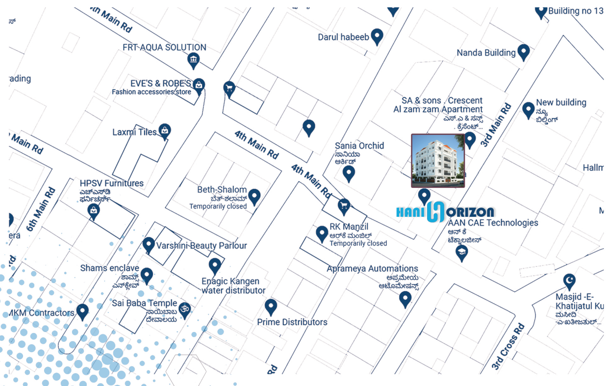
Location / Not to Scale